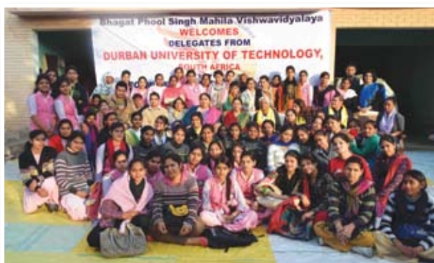
Foreign Delegates on the University Campus