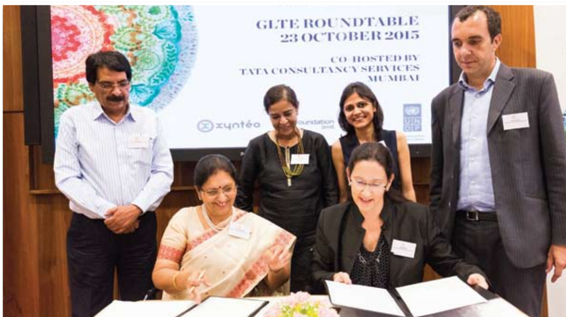
MOU with UNDP being Signed

International MOUs: BPSMV has signed MOUs with United Nations Development Programme (UNDP); Institute of Company Secretaries (ICSI), Delhi; Kwangwoon University, South Korea and St. Catherine University, USA.