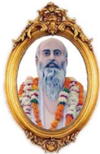
Bhagat Phool Singh Ji (1885-1942)

Born on February 24, 1885 at Mahra Village in Sonapat District, Bhagat Phool Singh was a visionary noble soul. His firm belief in empowerment and emancipation of women through education led Bhagat Phool Singh to establish a Gurukul for girls at Khanpur Kalan in 1936. The anti social elements did not appreciate the idea of women's education and consequently killed Bhagat Phool Singh on August 14, 1942.