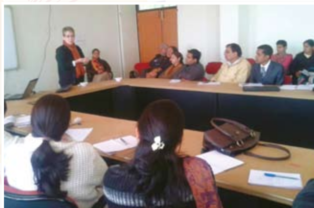
Faculty interaction programme