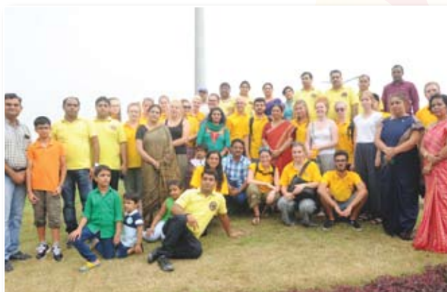
Foreign Delegates witnessing BPSMV's outreach programme