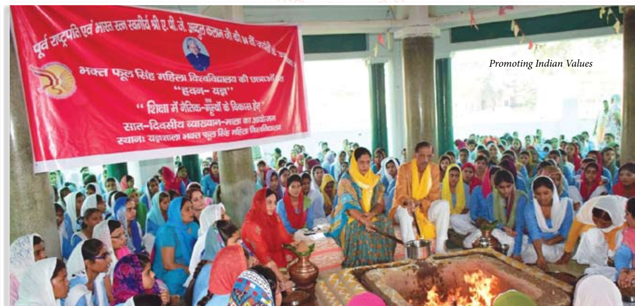
Promoting Indian Values

Centre for Indic-Asian Studies (CIAS): BPSMV is the first and only university in Haryana to be awarded UGC's prestigious Area Study Centre on Indic Asian Studies which carry out research on issues related to Indo-Asian knowledge systems. CIAS has operationalized its dedicated participative website www.sthaneshwaranidhi.ac.in which contains information on various themes pertaining to Indo-Asian culture and traditions. The Centre has so far published two books of international importance; Affinities India and Korea: Past and Present and Mekong-Ganga Axis .