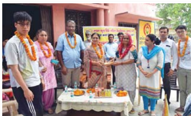
Foreign Delegates in the Adopted Village