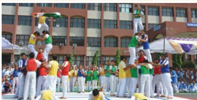
Campus School Students Performing Yoga Skills During Independence Day Celebration