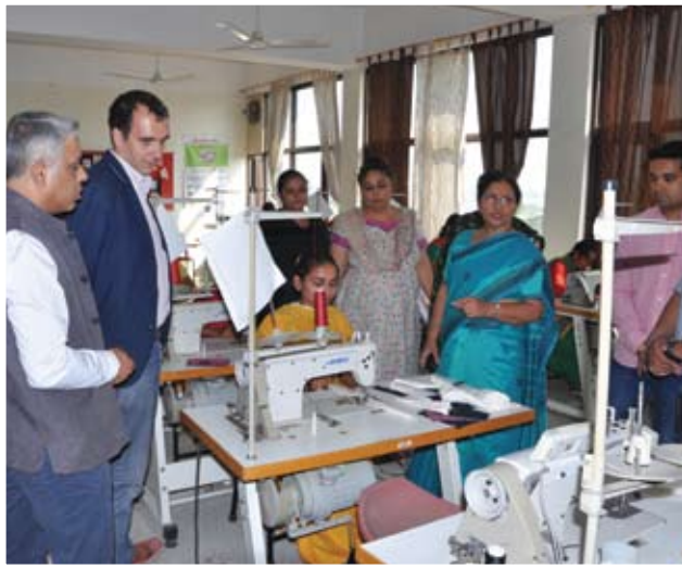
UNDP's Skills Development Workshop at BPSMV