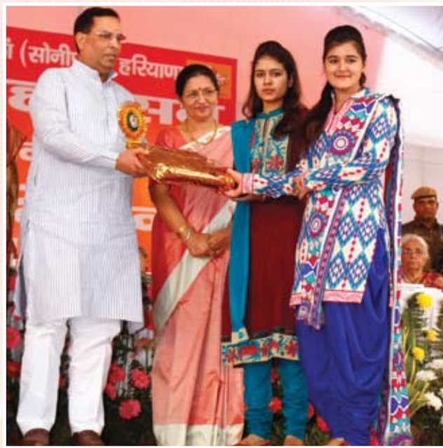
Capt. Abhimanyu, Hon'ble Finance Minister, Haryana inaugurating the Main Gate of MSM Institute of Ayurveda and giving away prizes during the University's Youth Festival

American interns from St. Catherine University, USA to complete their internship programme.