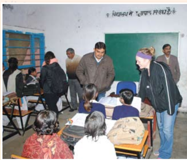
Interns from St. Catherine University, USA Interacting with the Students of Primary School, Kasandi, Sonapat