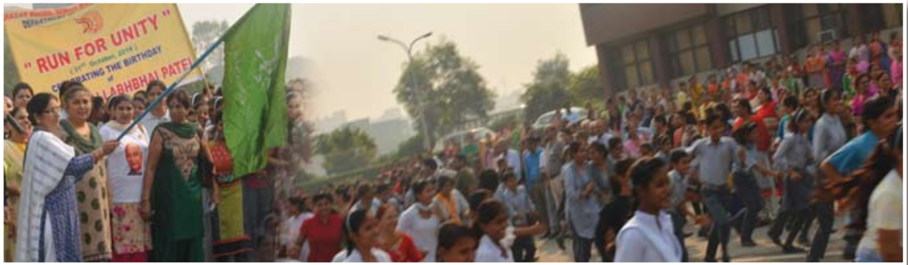
'Run For Unity' Flagged Off By Hon'ble VC, BPSMV