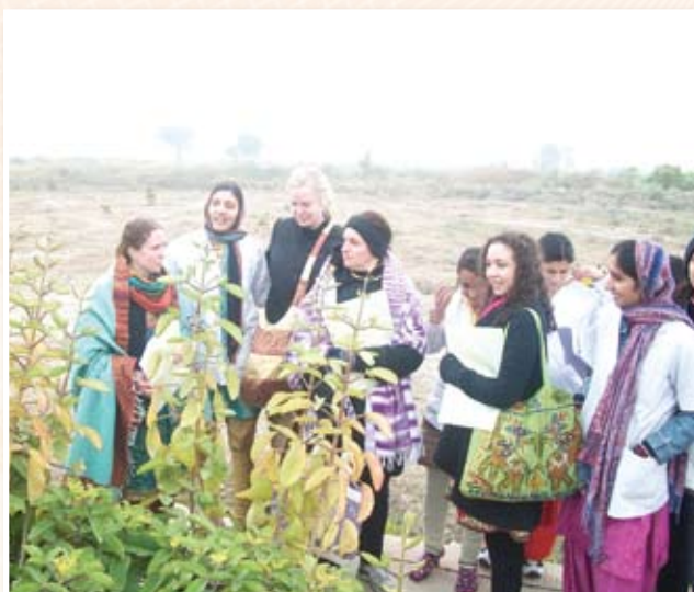
Foreign Visitors visiting University Herbal Garden