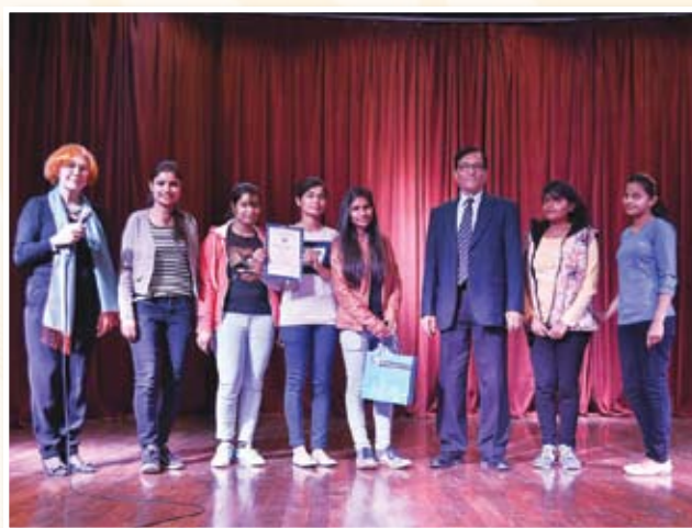
BPSMV's Students Participating in a Placement Session at the Russian Embassy in Delhi