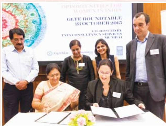
BPSMV's MOU With UNDP Being Signed