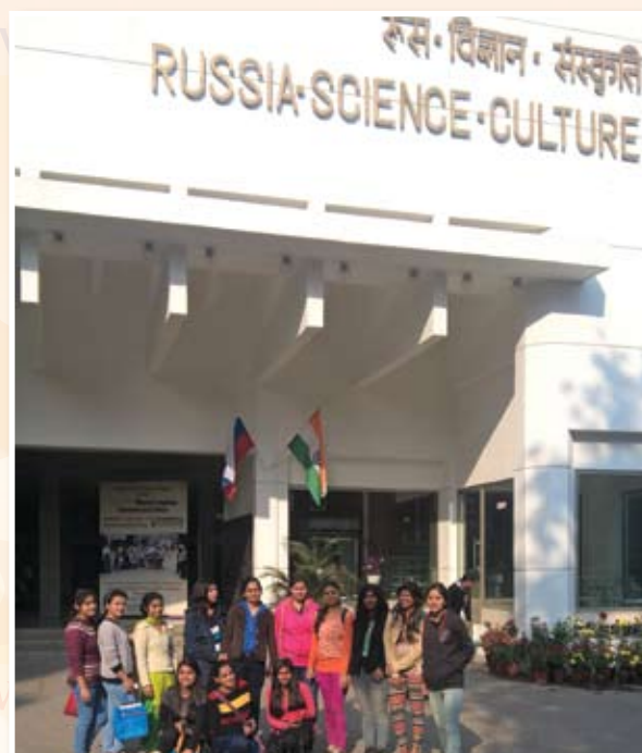
University Students with the Russian Embassy Official in Delhi

The university provides placement assistance to the meritorious students especially of the professional courses. The companies are invited to the campus for placement.