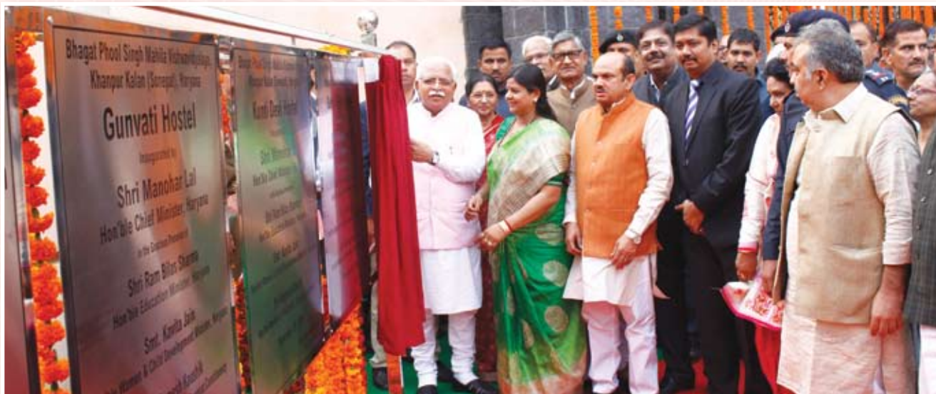
Shri Manohar Lal, Hon'ble Chief Minister, Haryana Inaugurating Newly Constructed Students' Hostel On The University Campus

Springer Link, Taylor and Francis, JCCC, Hein Online, West Laws, and Manupatra through UGC INFONET Digital Libraries Consortium.