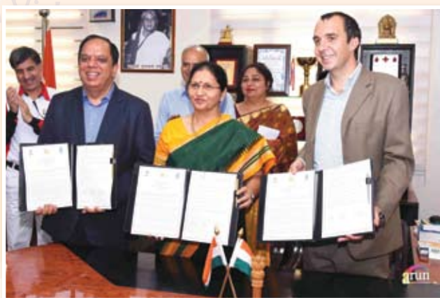
MOU with Hero Motocorp being done