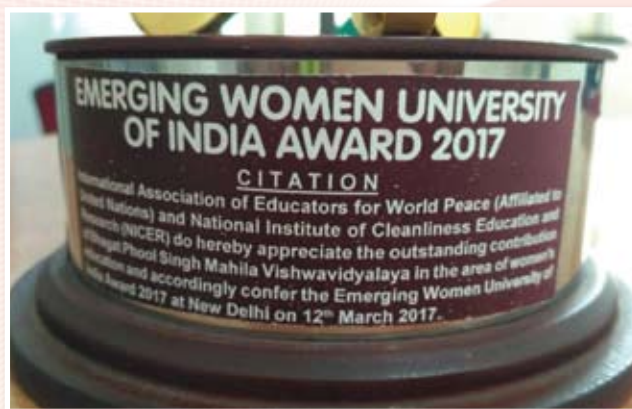
Emerging Women University of India Award 2017