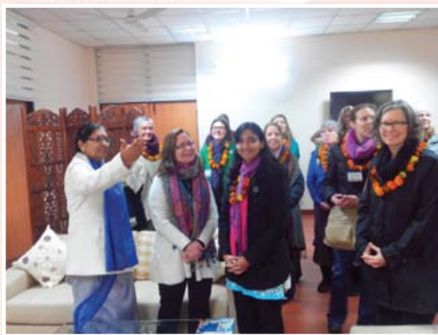
Foreign delegates from St. Catherine University, USA interacting with the Hon'ble VC, BPSMV