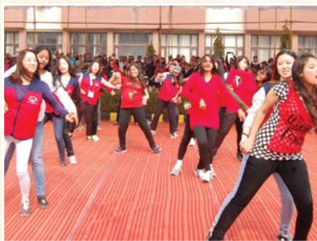
BPSMV Students dancing with their South Korean counterparts