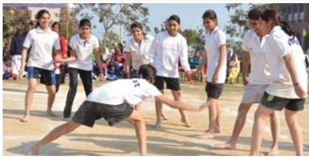
University Students Playing Kabaddi