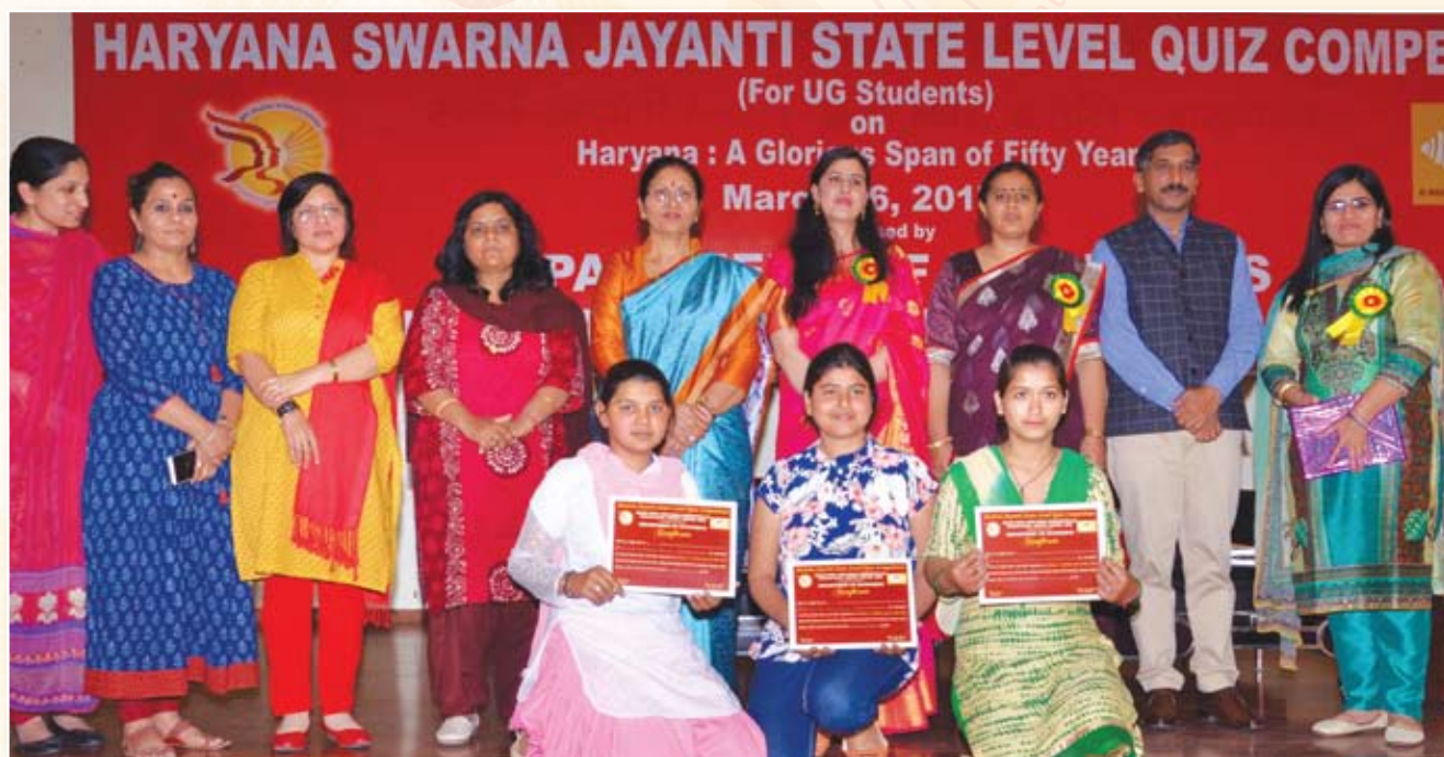
State Level Quiz Competition Organized By The Department Of Economics, BPSMV