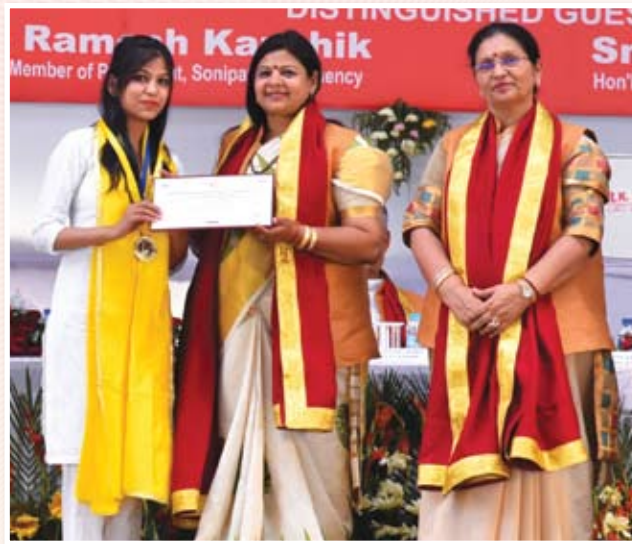
Graduates being Awarded Degrees at the 3rd Convocation by Hon'ble Prof. Kaptan Singh Solanki and Hon'ble Kavita Jain