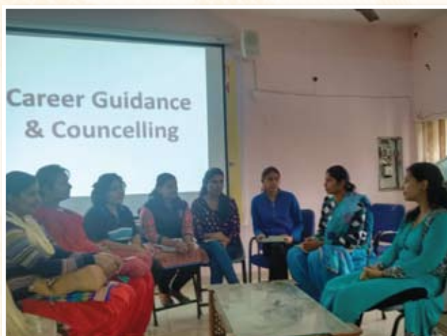
Career counseling and guidance session in progress

Central Library: The Central Library has a stock of approximately 17013 books. It has approximately 7000 users and subscribes to 55 National and International Journals, 04 Electronic Journals (IEEE, BENTHEM, Emerald and EBASCO Host), 70 Magazines & Periodicals and 22 Newspapers (Hindi & English). The library provides free access to reputed Journals like JSTOR, Oxford University Press, Wiley India,