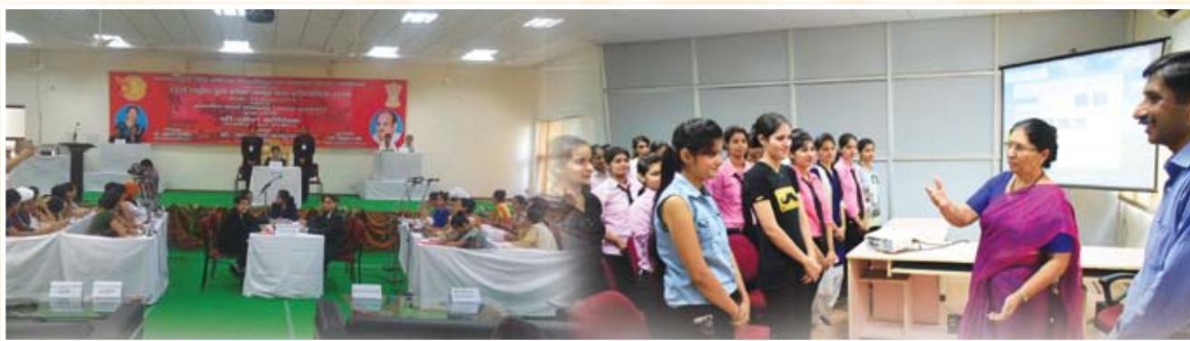
Hon'ble VC, BPSMV Conducting A Class On Communication Skills And Women Youth Parliament Session In Progress