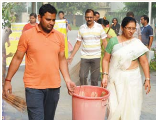
Cleanliness drive on the campus being led by VC, BPSMV