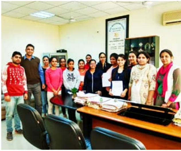
CSE & IT Students with their Teachers