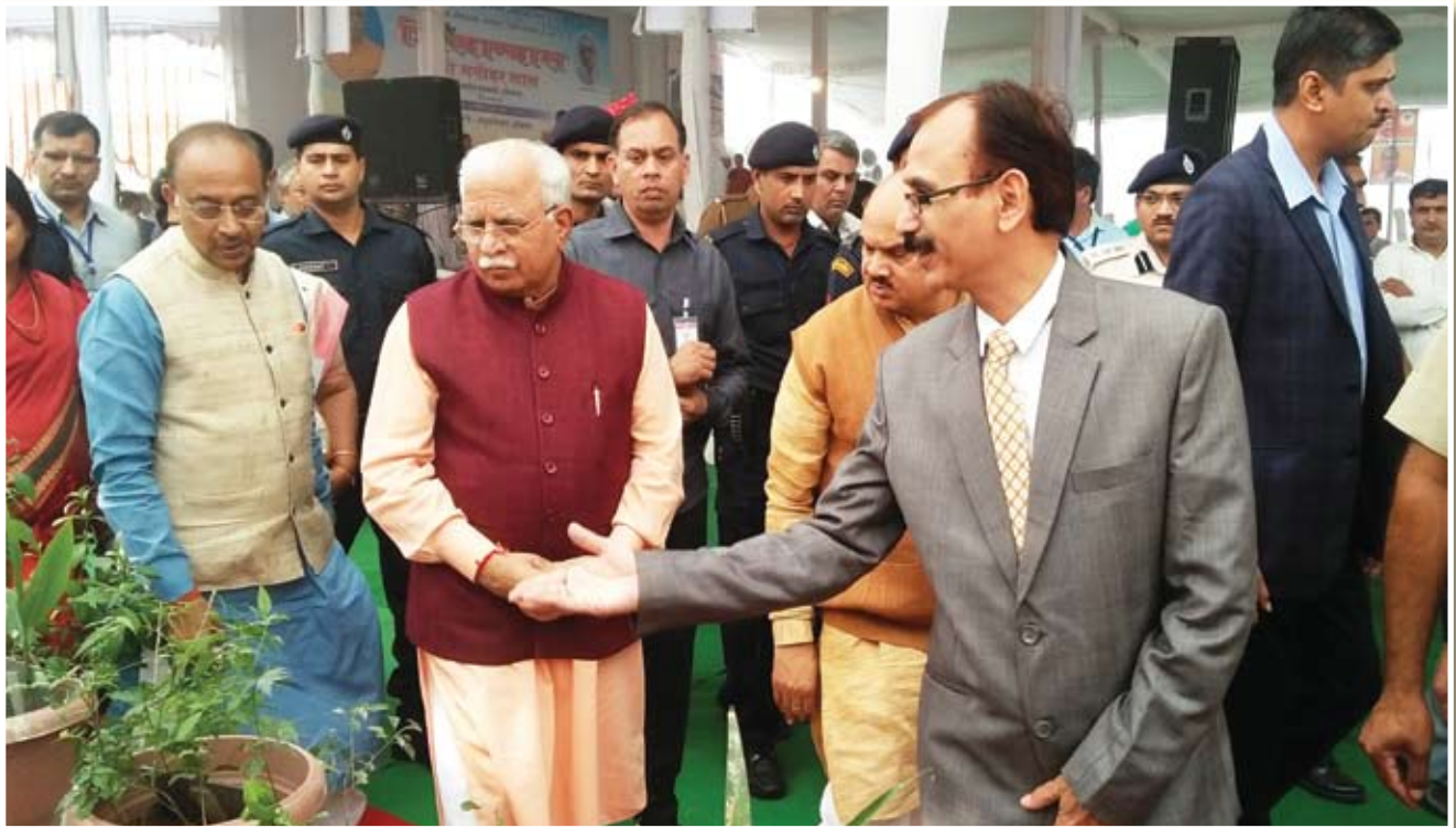
Shri Manohar Lal, Hon'ble Chief Minister of Haryana inspecting the Herbal Plants' exhibition organised by the University