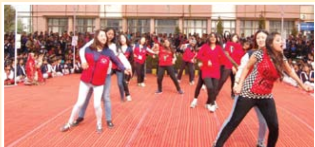
BPSMV Students dancing with their South Korean counterparts