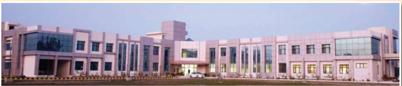
Subhashini Devi Administrative Block