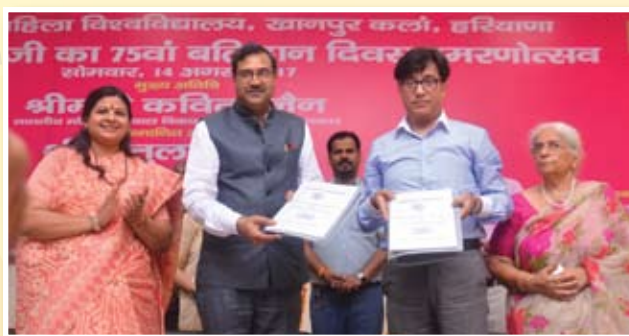
MOU being signed between BPSMV and Haryana Vishwakarma Skill University