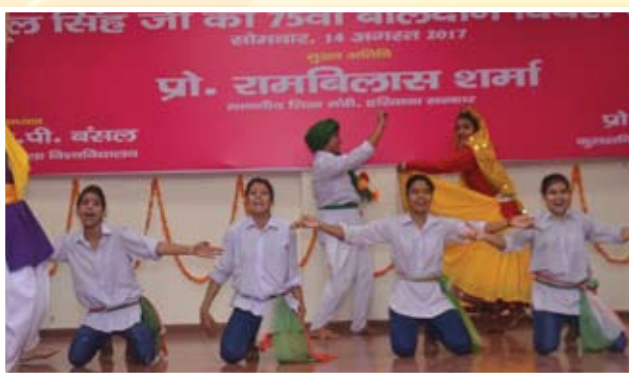
Dance Performing by University Students