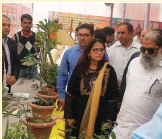
Shri Anil Vij, Hon'ble Health Minister, Haryana Visiting the University's Exhibition

University Placement and Counseling Cell (UPACC): UPACC provides free placement and counseling guidance to all the students of the University.