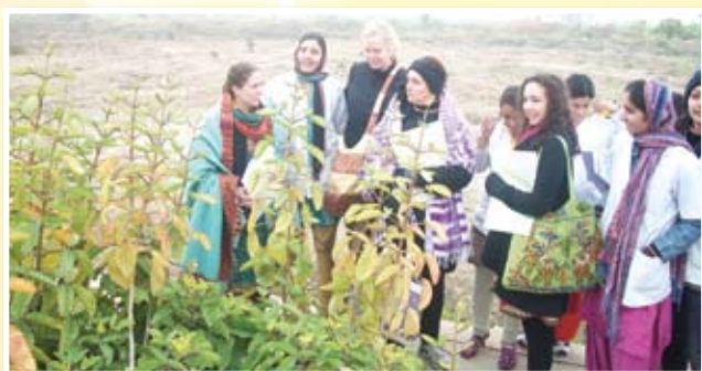
Foreign Visitors visiting University Herbal Garden