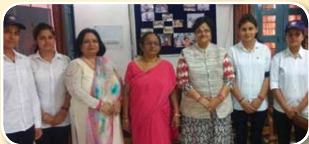
Felicitation of BPSIHL Students