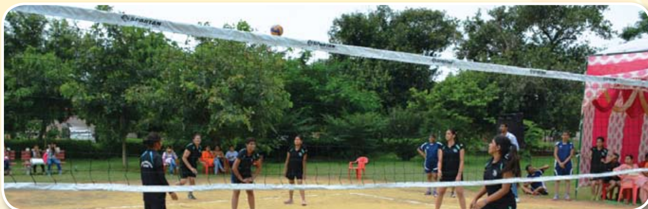
Students at Play