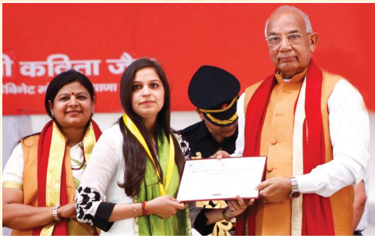
Prof. Kaptan Singh Solanki, Hon'ble Governor, Haryana awarding degree at the 3rd Convocation of the University