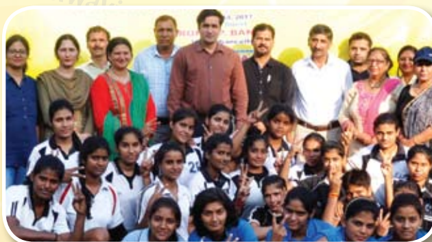
Kabbadi Team of BPS Mahila Polytechnic