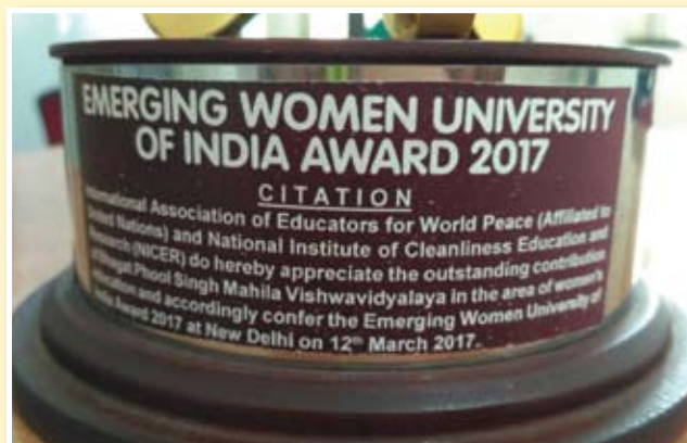
Emerging Women University of India Award 2017