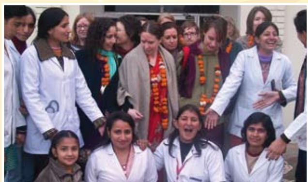
Foreign Visitors Visiting MSM Institute of Ayurveda