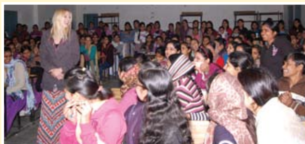
Intern from St. Catherine University USA interacting with the students