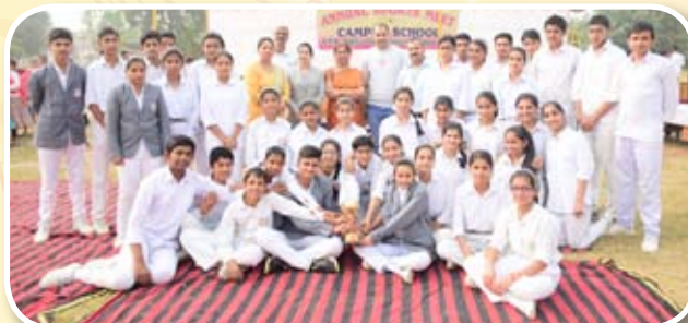
Campus School Students