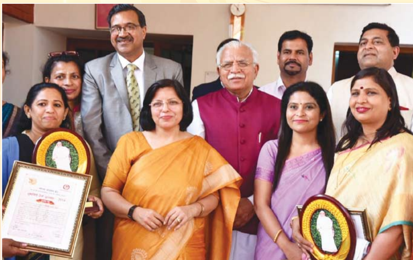
Shri Manohar Lal, Hon'ble Chief Minister, Haryana with the Receiver of the First Subhashini Devi Award.