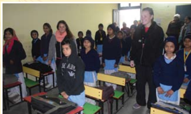
Interns from St. Catherine University, USA Interacting with the Students of KGSS School, BPSMV