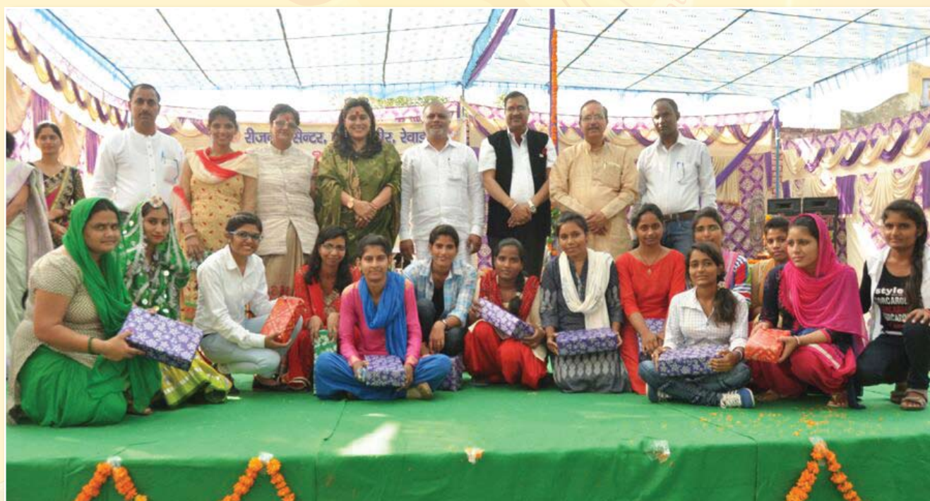
Esteemed Guests at Regional Center Lula Ahir