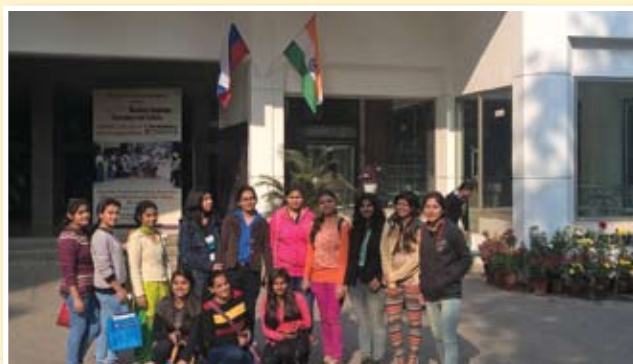
University Students with the Russian Embassy Official in Delhi

The university provides placement assistance to the meritorious students especially of the professional courses. The companies are invited to the campus for placement.