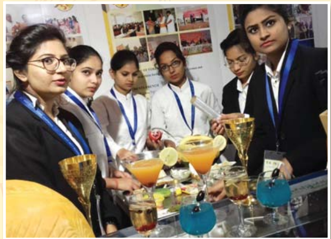
Prize distributionn function at BPSIHL