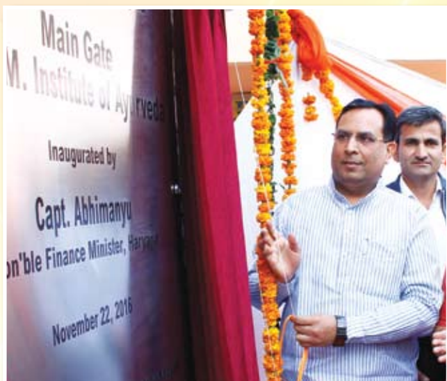
Captain Abhimanyu, Hon'ble Finance Minister, Haryana Inaugurating the Newly Constructed Main Gate of MSM Institute of Ayurveda