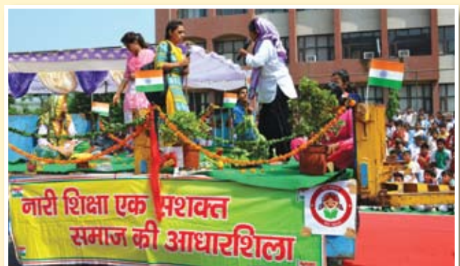
Social Awareness Rally