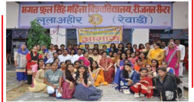
Faculty and Students