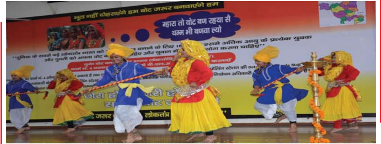
BPSMV'S students performing during the Voter Awareness programme organized on the University Campus by CEC, Haryana