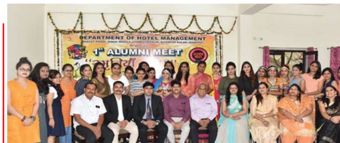
Faculty and Students

The Department was established in 2009 with the Grant of Rs. 2 Crore received from the Ministry of Tourism, Government of India. Presently, the department offers Bachelor of Hotel Management (BHM) and Master of Hotel Management (MHM) programmes. The programmes offer opportunities to young hospitality professionals aspiring for exciting and rewarding career in various high growth service industries such as hotels, aviation, multi national fast food companies, shipping and cruise liners, catering and various other fields. The alumni of the department are working in reputed national as well as international hospitality organizations.