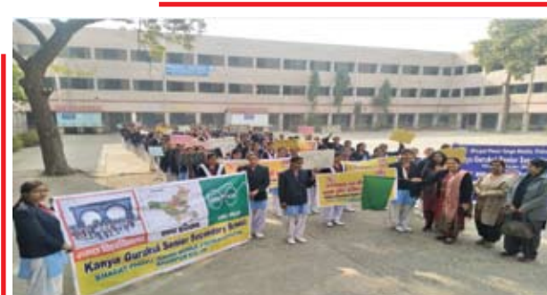
Students taking out an awareness rally