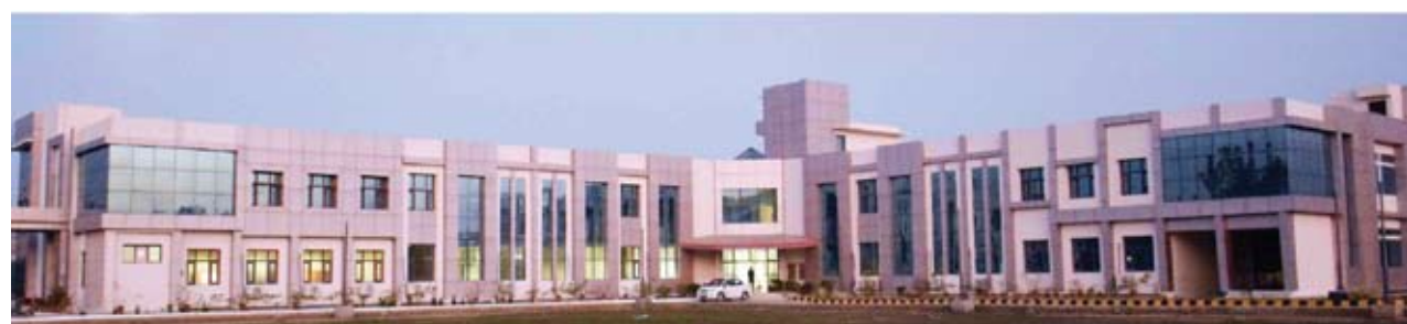
Shubhashini Devi Administrative Block