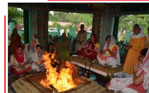
Hawan being performed at the University's Yagshala (यज्ञशाला)