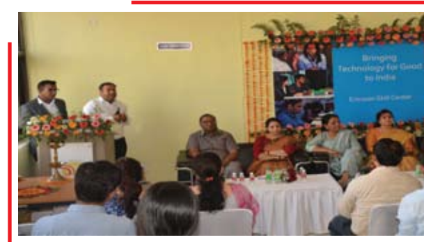
An Interactive Session