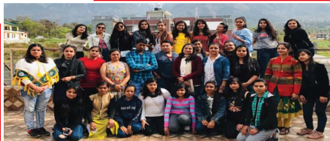
Department's students on an excursion trip

The Department of English is one of the pioneer teaching departments of the University. Besides offering various programmes, the department owns the responsibility of honing communication skills of the students with the purpose of ensuring an all-round and comprehensive development of the learners along with nurturing their cultural perspectives. Lectures by renowned experts both from India and abroad are conducted by the Department for expanding the academic horizon of the students.