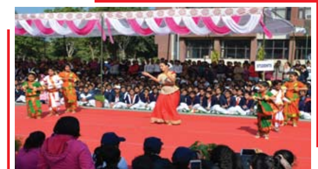
Students Performing during Independence Day's Celebration