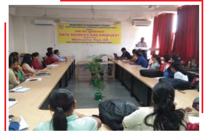
Conference being organised