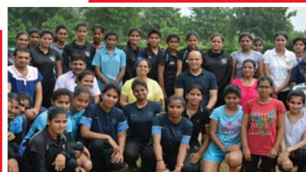
Students and Faculty of the Department of Physical Education