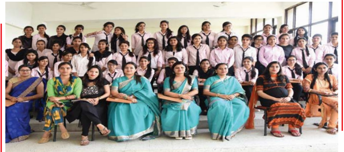
Faculty and Students

Department of Commerce was established in the year 2009 with the vision of "Empowering Women". The Department focuses on knowledge enhancement, developing leadership skills and character, innovative thinking abilities, values and ethics, providing mentorship opportunities, churning out result oriented leaders, entrepreneurs, accountants and managers in consonance with the requirements of corporate world.