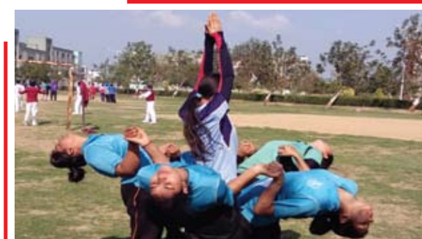
A yoga performance by the University's students