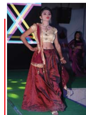
Fashion Show 'Paridhan' organized by the Department