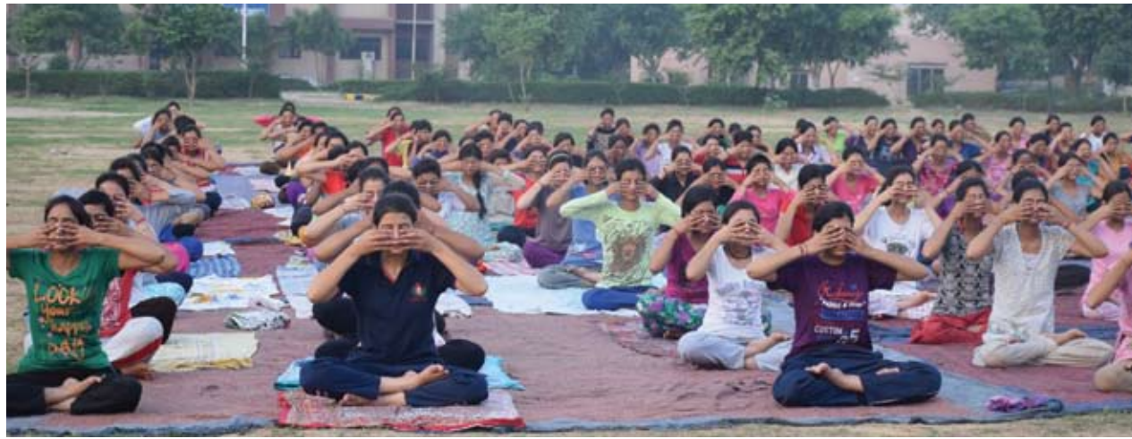
A session on Meditation being organized on the University Campus