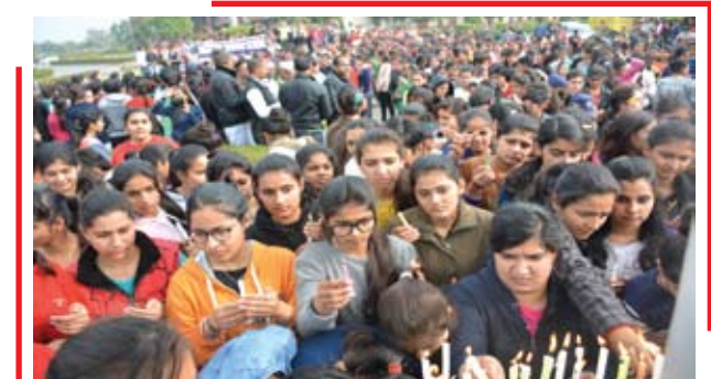
Students taking out a Candle March for the Martyrs of Pulwama terrorist attack