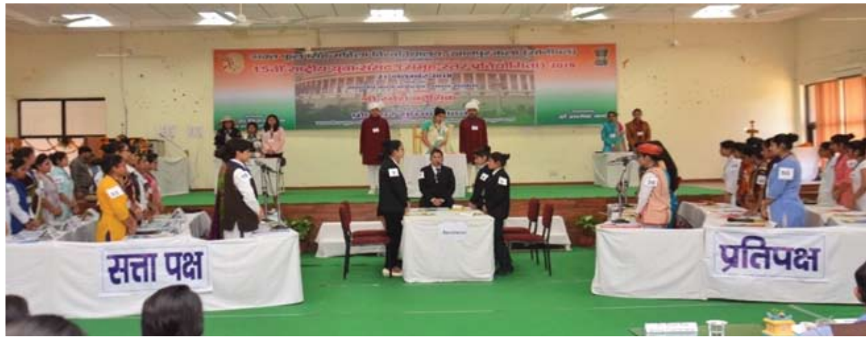
Women Youth Parliament being conducted on the University Campus