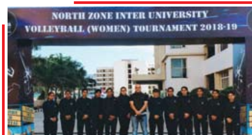
BPSMV Volleyball Team participated in North Zone Volleyball Tournament

The Department of Physical Education has been established to provide qualitative academic programmes in Physical Education. The department shall provide state of the art theoretical and practical training to the admitted students and produce quality human resources for the country. The department has good paraphernalia required for programmes in Physical Education.