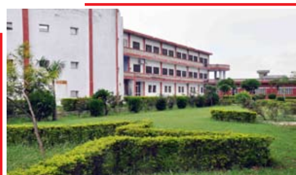
Institute's Main Building