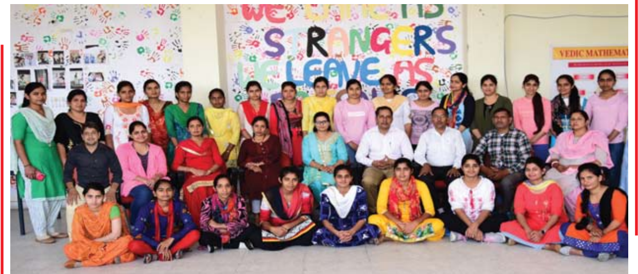
Faculty and Students

The Department of Basic and Applied Sciences came into existence in July, 2013. The department is committed to empower the girl students in the field of basic sciences. Workshops, study tours, sports meets, cleanliness drive etc are organised by the department from time to time. The department also organizes parent teacher meet to keep parents informed and obtain their feedback. The basic aim of the department is to inculcate scientific temperament and love for basic sciences.