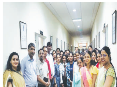
Arya Adarsh Girls' College Madlauda Students at LRC