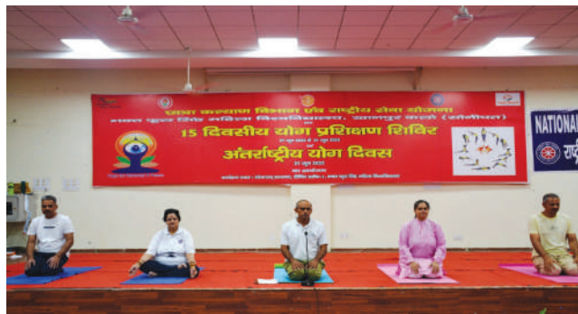
Yoga Training Camp