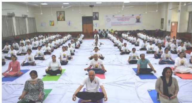
International Yoga Diwas being Celebrated