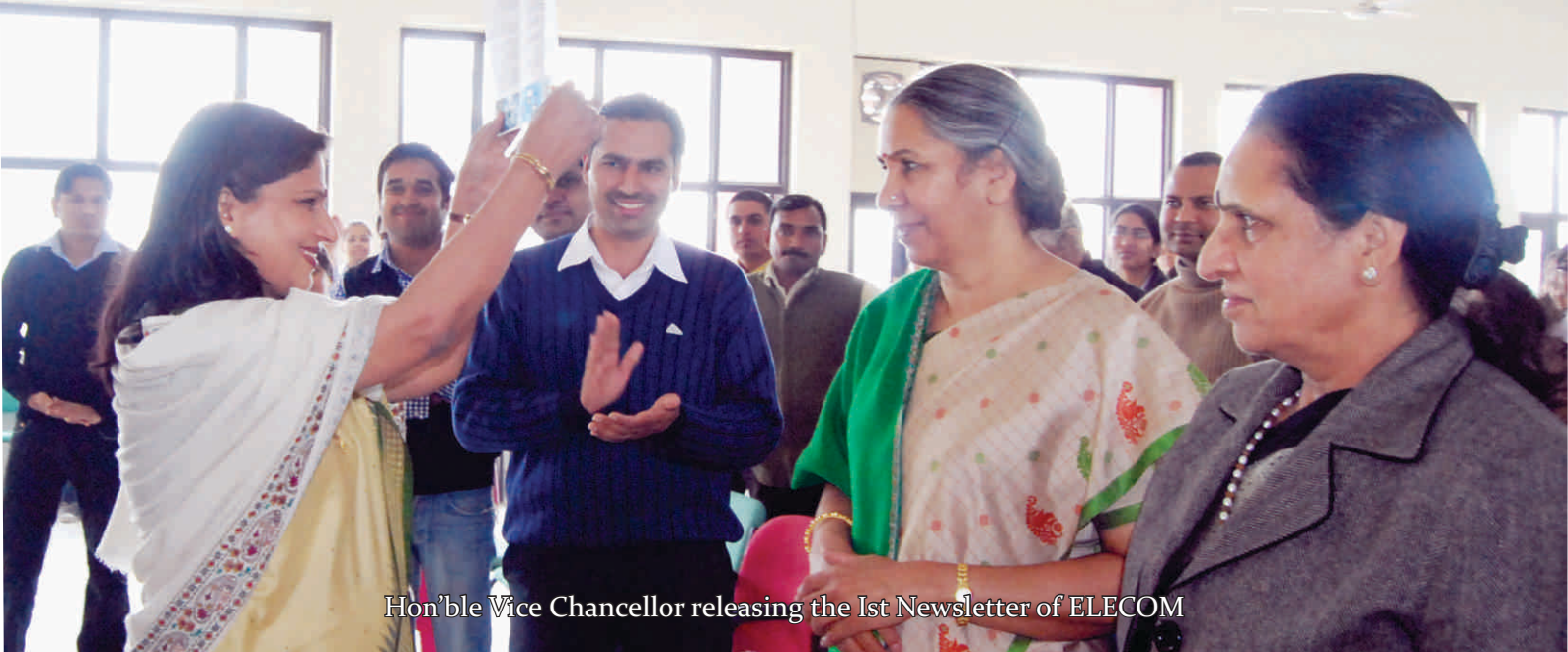
Hon'ble Vice Chancellor releasing the 1st Newsletter of ELECOM