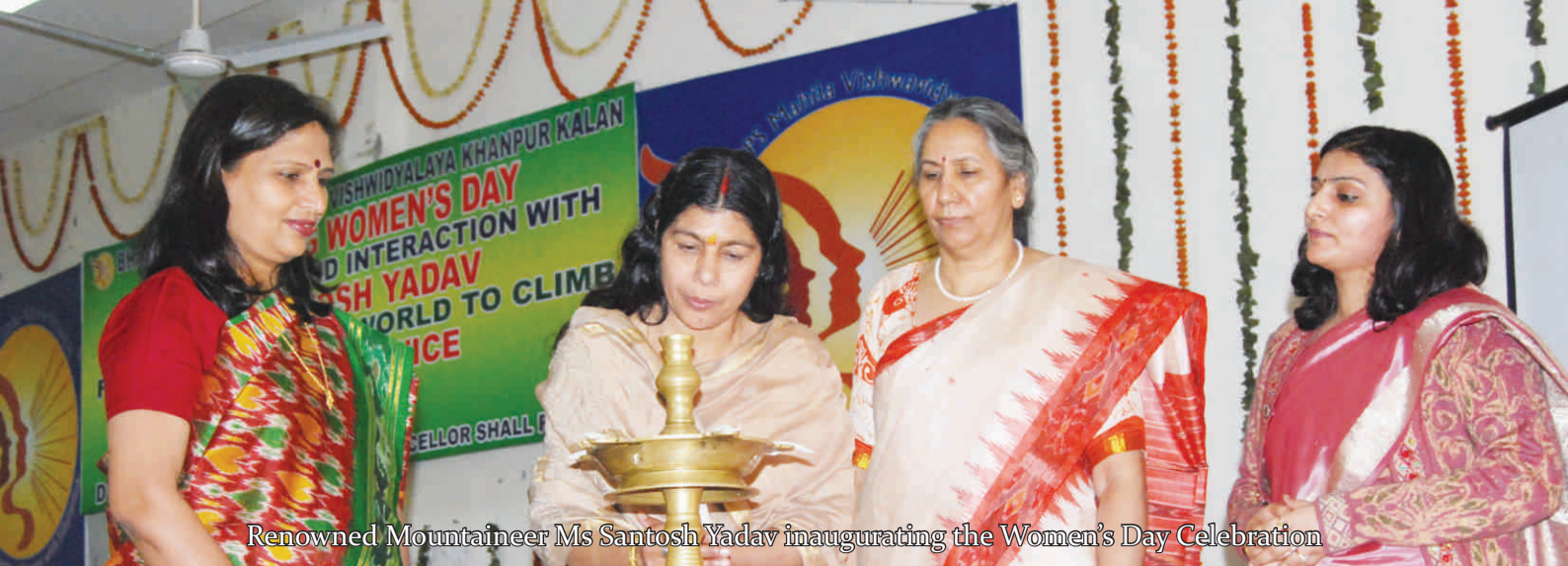
Renowned Mountaineer Ms Santosh Yadav inaugurating the Women's Day Celebration