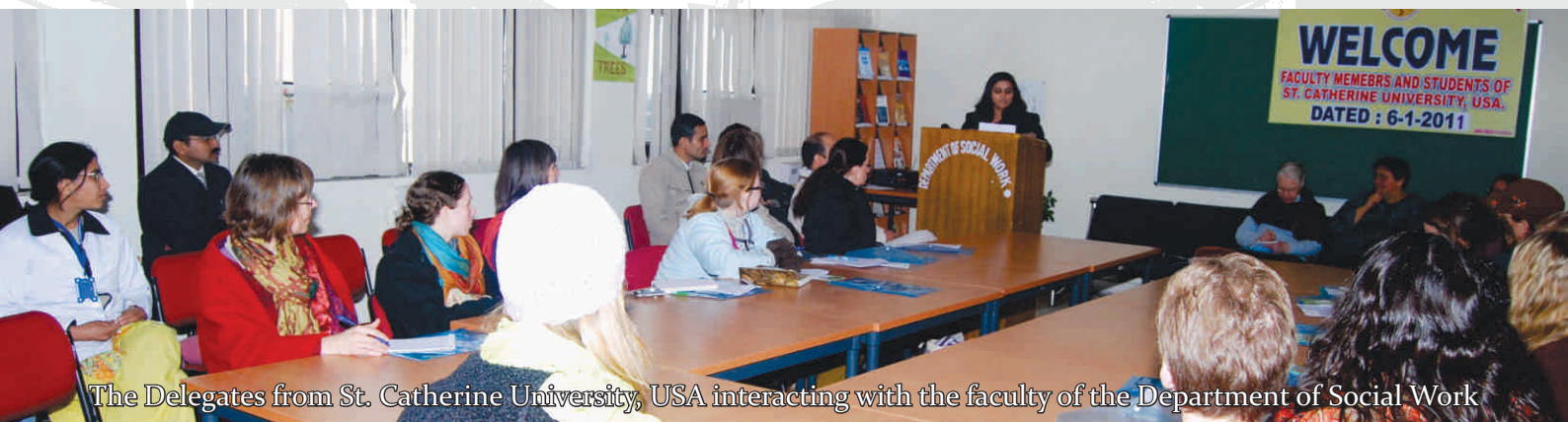
The Delegates from St. Catherine University, USA interacting with the faculty of the Department of Social Work