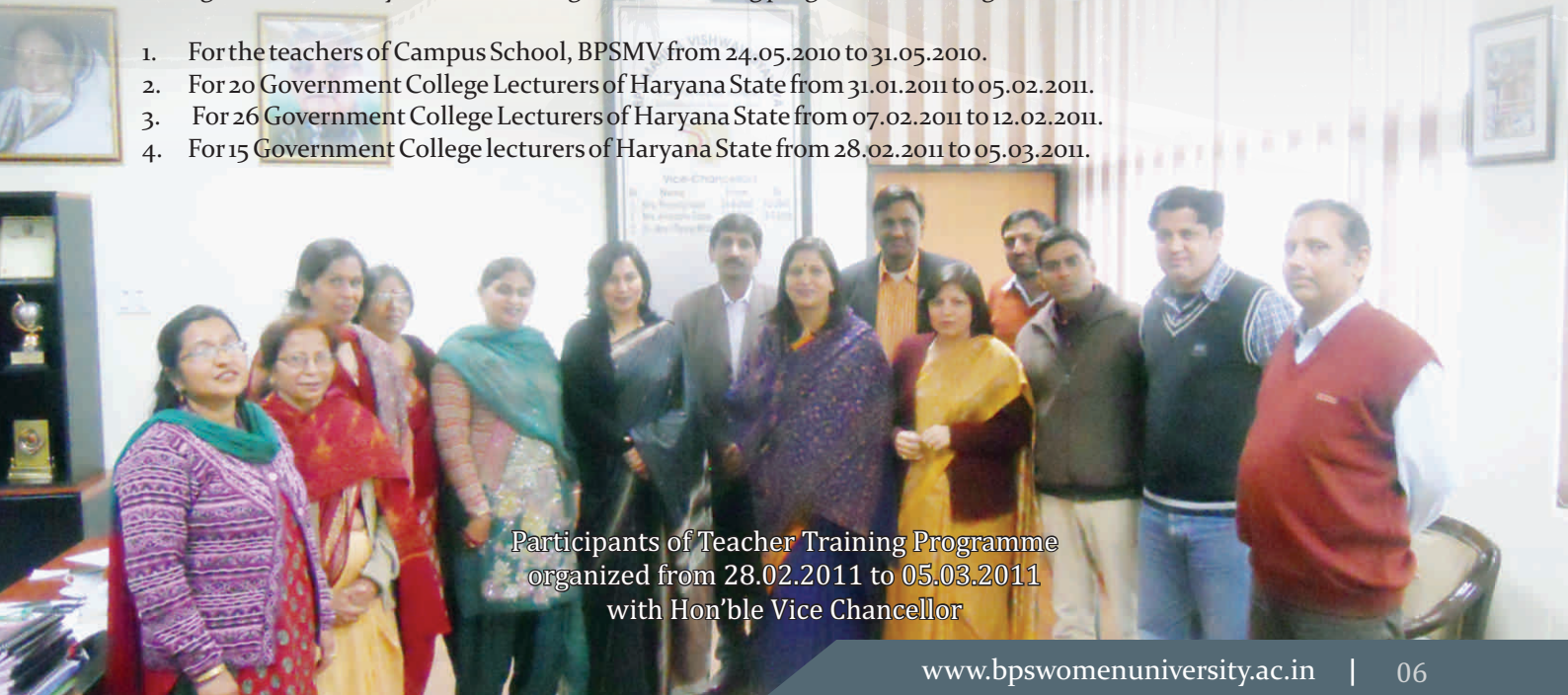
Participants of Teacher Training Programme organized from 28.02.2011 to 05.03.2011 with Hon'ble Vice Chancellor