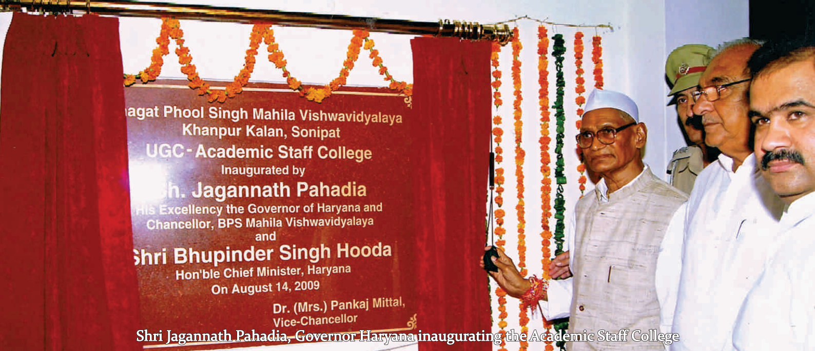
Shri Jagannath Pahadia, Governor Haryana inaugurating the Academic Staff College