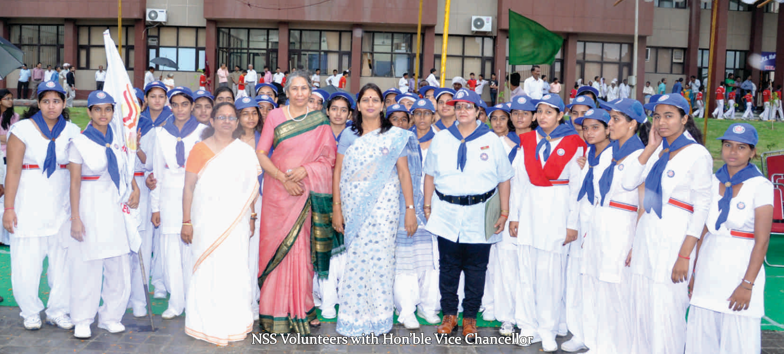
NSS Volunteers with Hon'ble Vice Chancellor