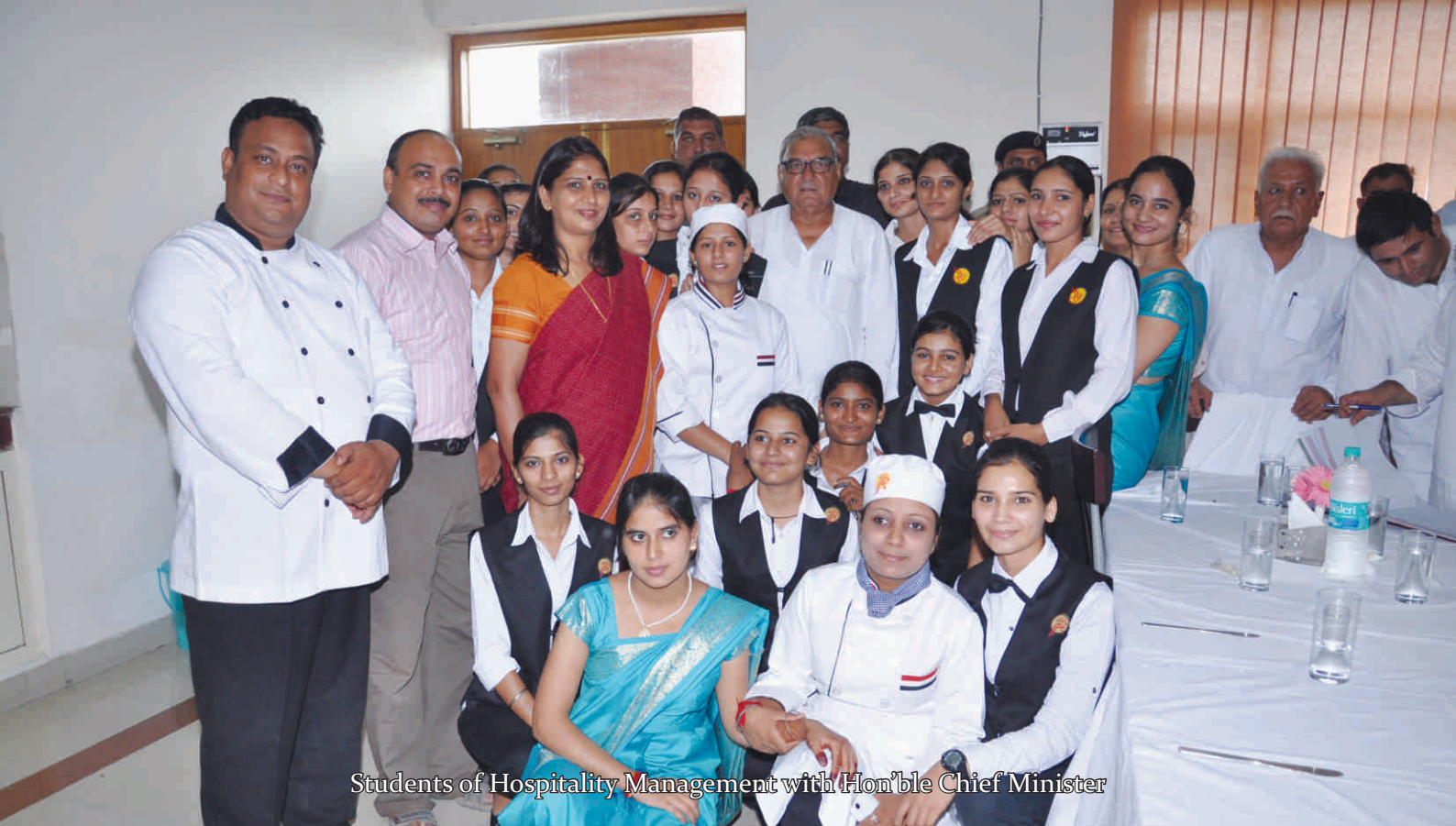
Students of Hospitality Management with Hon'ble Chief Minister