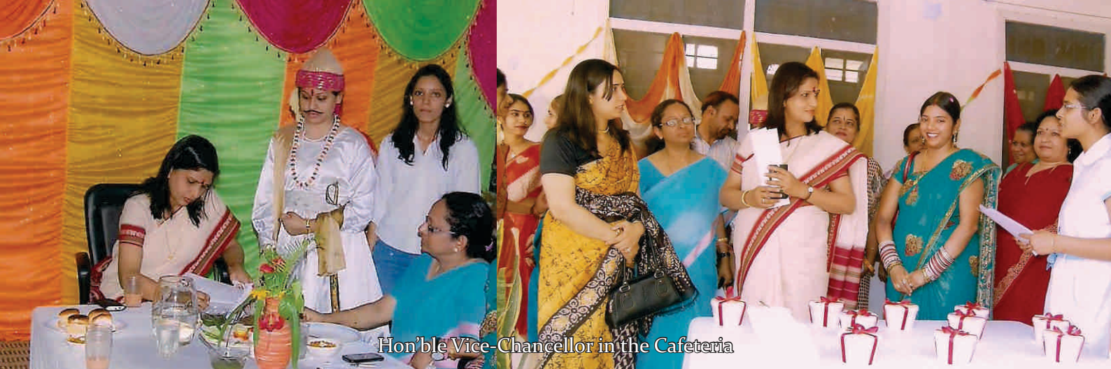
Hon'ble Vice-Chancellor in the Cafeteria