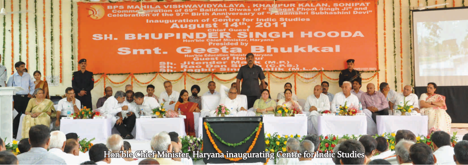
Hon'ble Chief Minister, Haryana inaugurating Centre for Indic Studies