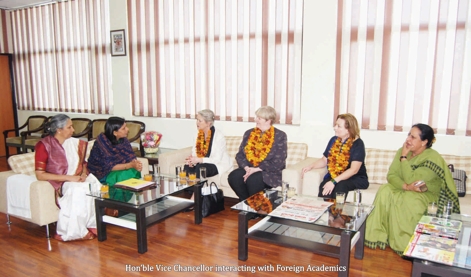
Hon'ble Vice Chancellor interacting with Foreign Academics