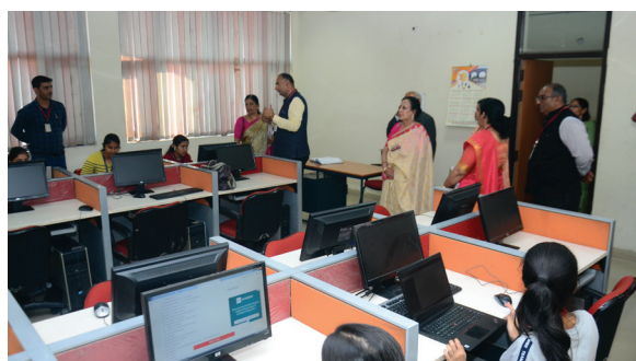
The members of the peer team inspecting the Department of Computer Science & Engineering