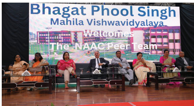
The NAAC Peer team interacting with the teaching staff of the university and during the cultural event