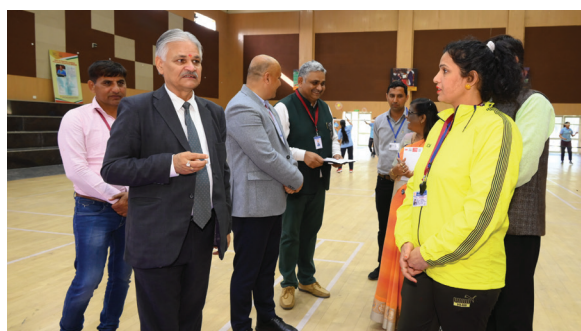
The NAAC Peer team inspecting the sports infrastructure and interacting with the sports women