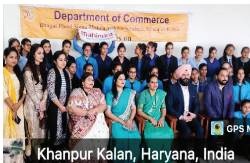
Khanpur Kalan, Haryana, India