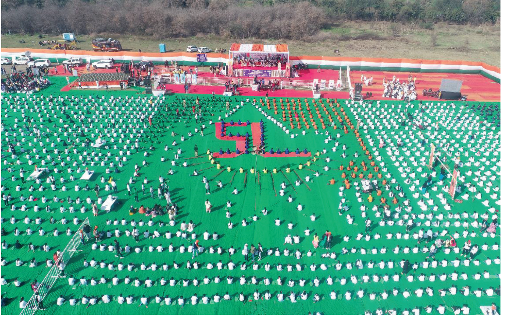
Closing Ceremony of 75 Lakh Suryanamaskar Abhiyan

वत्सल भाव से किया था पोषण, पद्यश्री का मिला सम्मान 2006 में हुआ निर्मित महिला विश्वविद्यालय महान यहां खुला नारी शिक्षा का एक नया आयाम कठिन रास्तों पर चलने का इसको मिला ऐसा वरदान बना रहा सारी दुनिया में यह अपनी नई पहचान सपनों को साकार किया, भरी नई उड़ान साक्षर और सक्षम होकर छू लिया है आसमान विश्वविद्यालय वंदन तुमको - वंदन शत अभिनंदन