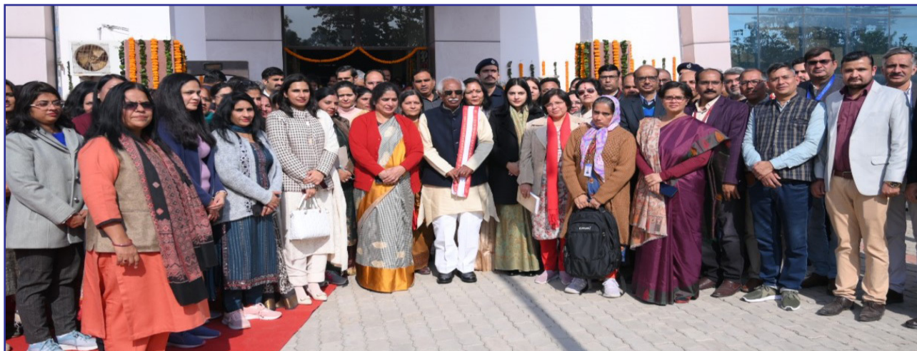
Hon'ble Chancellor Shri Bandaru Dattatreya with the Vice Chancellor, Registrar, Faculty and Staff