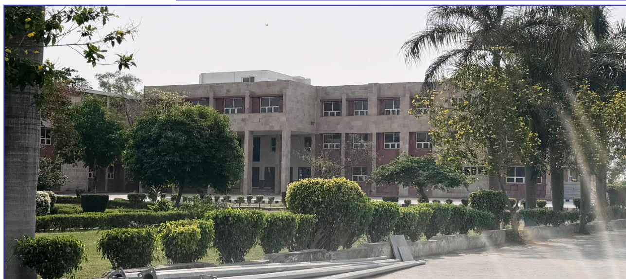
The New Building Constructed for the DPER