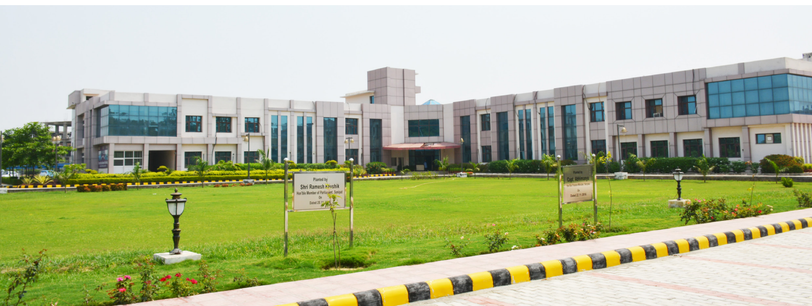
Subhashini Devi Administrative Block