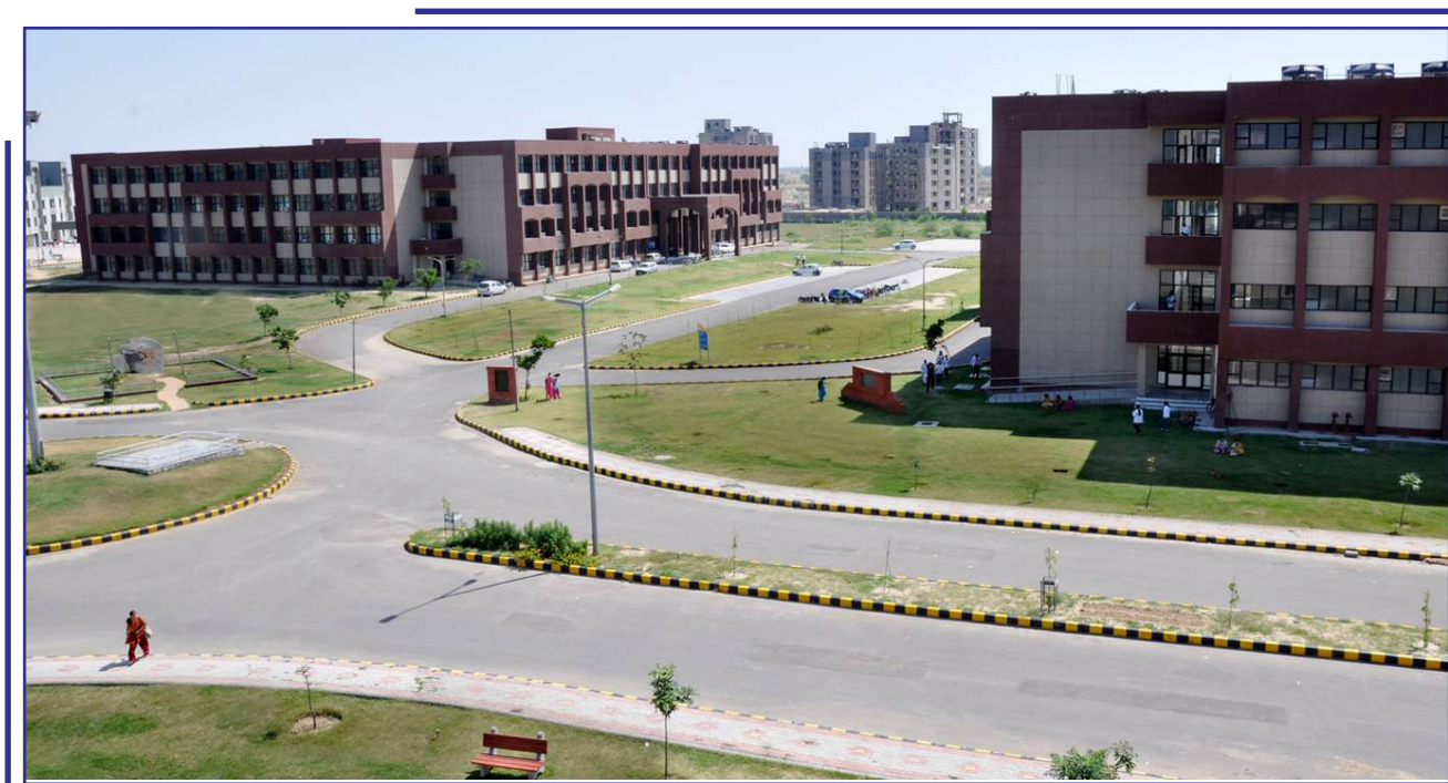
An Overview of the University's Main Campus

* 03 R.H. has been converted into gazetted holidays.